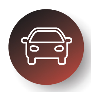
Scope 1 - Vehicles